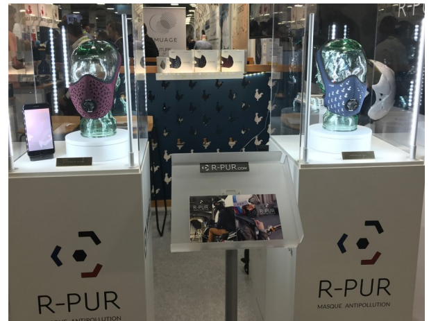
A CES 2019 display for R-PUR, an anti-pollution mask designed for bicycle and motorcycle users.

The Digital Health Summit emphasized that the future of health care is consumer-focused—delivered anywhere, at any time, with convenience, customization, and prevention at the forefront. The technologies on display represented an ecosystem that can help people live their healthiest, most independent lives possible. The Summit’s prominent themes included diagnosing, monitoring, and attempting to prevent the development of health conditions at home; “gamifying” wellness activities; empowering consumers with secure, one-stop access to health data generated from medical records, wearables and trackables, and DNA testing; and using voice and using smart home innovations to promote senior health and independence.