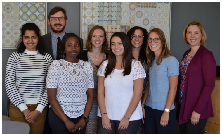
The 2018 cohort of JHF summer interns.

To apply, please complete the application on the Health Careers Futures website , which