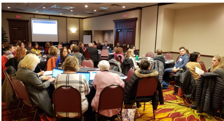
During a January 10 event held in Cranberry, PA, western Pennsylvania members of the Centers of Excellence Technical Assistance Project share progress in expanding access to opioid use disorder treatment and ensuring continuity of care for patients.

Many of the personnel involved were social workers, care navigators, certified recovery specialists, and administrators. During the sessions, the COEs shared their successes around engaging and retaining clients. They received an update about a transition to managed care per member per month payments, and participated in breakouts to discuss how to operationalize the new process.