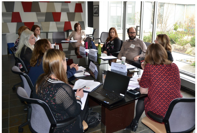
During a breakout session on April 26, a group of Patient-Centered Medical Home Learning Network members discuss strategies to coordinate care with mental health and substance use providers.

During year one, PRHI facilitated quarterly, regional learning collaborative sessions (both in-person and virtual) in the Southwest/Northwest and Northeast PA regions, while also organizing a pair of statewide virtual office hours. PRHI partners with the Health Federation of Philadelphia (HFP) to facilitate the Learning Network in the Lehigh/Capital and Southeast regions of Pennsylvania. In-