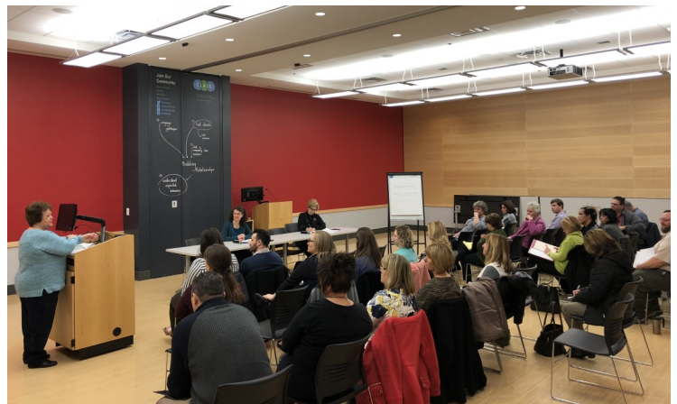
A Community HealthChoices consumer listening session at CLASS (Community Living and Support Services) in Braddock.

Community HealthChoices officially rolled out in southwestern Pennsylvania at the beginning of 2018, and will be implemented in other regions of the Commonwealth through 2019. To track and improve the Community HealthChoices experience in our region and inform the rollout of the program elsewhere, JHF is coordinating a series of listening