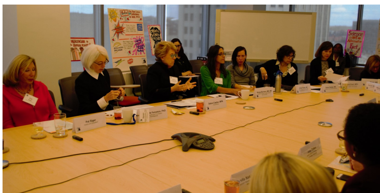
The WHAMglobal Regional Advisory Committee features leaders with backgrounds in maternal care, research, policy, workforce development, communications, public health, and community activism.

The WHAMglobal Regional Advisory Committee features leaders with backgrounds in maternal care, research, policy, workforce development, communications, public health, and community activism. The committee will collaborate with WHAMglobal and WHAMglobal partners to advance a statewide