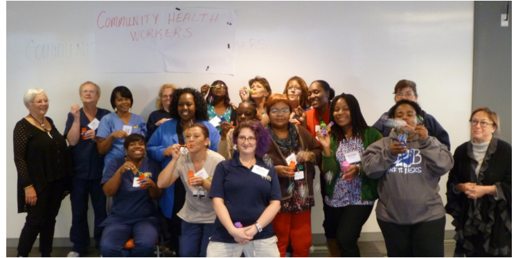
JHF and its supporting organizations have launched a variety of initiatives to advance the skills and role of community health workers, including developing a Champions program for LIFE staff members (pictured here).

Over the past four years, JHF has strived to make community health workers (CHWs) a vital part of care teams. CHWs can be a force for improved population health, bridging the gap between medical and social services for groups ranging from expectant mothers to older adults who want to remain living safely in their homes and communities. To advance this emerging workforce role, JHF has organized statewide task forces focused on CHW training, policy, and employment; provided quality improvement training and coaching to Living Independently for Elders (LIFE) staff members as part of a CHW Champions program; and offered a range of educational courses to frontline workers through the Foundation's Long-Term Care and Community Health Worker Training Center.