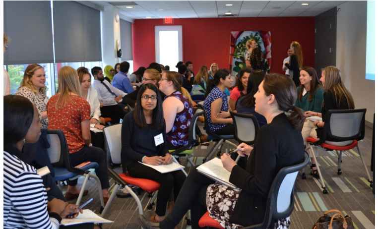
The 2018 Patient Safety Fellowship features 34 emerging health leaders, from ten different schools and 17 different disciplines.