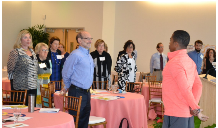
JHF’s charrettes, including the senior exercise and recreation-focused event from 2016 pictured here, inspire new programming and partnerships that strengthen services for our region’s older adults.

Through its Senior Connections initiative, JHF is engaging community partners to strengthen service opportunities for older adults in southwestern Pennsylvania and beyond. Charrettes, or community planning sessions, are a cornerstone of the Senior Connections initiative. The charrettes bring together thought leaders and practitioners from across disciplines and industries for senior-focused discussion and strategic planning. JHF has convened partners to tackle challenges related to exercise and recreation, geriatric-friendly health care, and housing, resulting in new programming and collaborations that help seniors live safer, more satisfying lives.