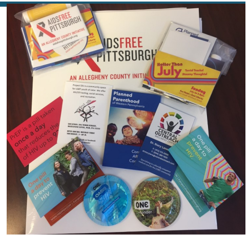
AIDS Free Pittsburgh handed out more than 2,000 safer-sex kits during 2018 Pride events held in June.

AFP is managed by JHF and financially supported by the Allegheny Singer Research Institute (Allegheny Health Network) and UPMC Presbyterian Shadyside.