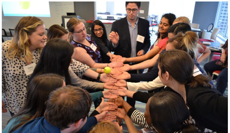
On June 6, the Patient Safety Fellows learn the fundamentals of teamwork and incremental improvement during a ball-pass game. The Fellows' challenge is to have every person pass the ball in the shortest amount of time possible.