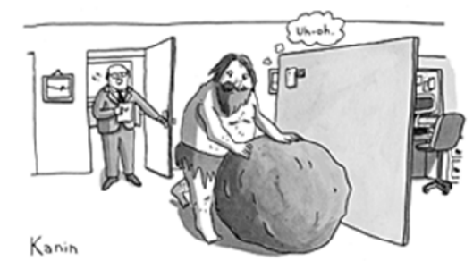
"Hey, Sisyphus, when you've got a minute I'd like to discuss this progress report with you."

Ten years of demonstrating the proposition followed. PRHI tested the assumption through delivery system improvements in removing errors such as HAIs, preventing hospitalizations, and reducing waste through better teamwork, problem solving at the point of care and enhanced primary care. We applied our quality improvement method, Perfecting Patient Caresm, and achieved universal success.