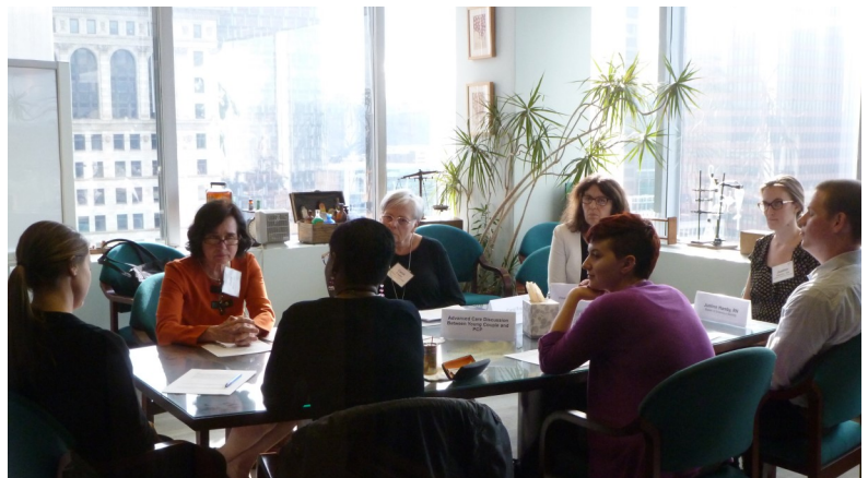
During the Death and Dying Fellowship finale on March 27, Fellows engage in practice end-of-life conversations with JHF staff.

These are among the difficult, yet paramount conversations that healthcare professionals may have with patients and loved ones who are confronting decisions about end-of-life care. They're conversations that frequently take place too late, if at all. Eighty percent of Americans feel it's important to discuss end-of-life matters with their doctor, but less than 10% actually do, according to a 2012 survey conducted by the California Healthcare Foundation. Ninety percent want to plan for such situations with family, yet only 30% specify those plans.