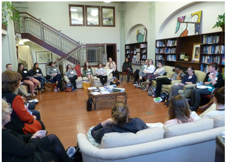
During a session held on March 20, the Death and Dying Fellows learn about the experience of families and caregivers coping with end-of-life matters at the Good Grief Center—Ursuline Support Services.

The Fellows discussed advance care planning and the legal aspects of death and dying at UPMC Shadyside; toured the Shadyside ICU and learned about Pennsylvania Orders for Life Sustaining Treatment (PA POLST); explored pediatric palliative care, spirituality, and family dynamics at Children's Hospital of Pittsburgh of UPMC; visited West Penn Hospital to discuss hospice services; learned about