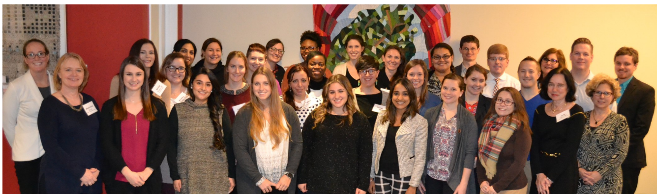
The 2017 Fellowship on Death and Dying participants, along with JHF staff.

“Being an ICU nurse, we’re usually focused on the machines and how we can use them to ‘fix’ someone in the ICU,” one of the Fellows said during the last session. “I like being able to step into different situations, and I learned something about myself during the role plays. It’s about your willingness to be emotionally brave. I felt so comfortable with everyone in my group.”