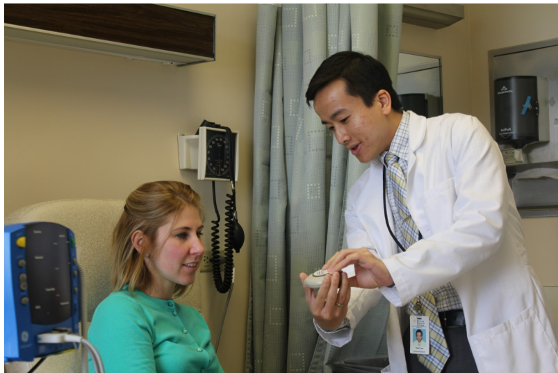
A Primary Care Resource Center team member shows a patient how to properly use her inhaler. As part of the PCRC project, enrolled patients received in-depth disease management and medication reconciliation services.

The care teams worked to improve patient care and reduce total cost of care for patients with chronic obstructive pulmonary lung disease (COPD), congestive heart failure (CHF), and/or acute myocardial infarction (AMI). The PCRC teams provided 30 minutes of inpatient disease management education and teach-back, motivational interviewing, and discharge medication reconciliation. The teams then bridged the patient’s transition from hospital to home by providing post-discharge nursing and pharmacy consults, ensuring that a prompt follow-up appointment with the patient’s PCP, and making home visits to patients with particularly challenging life circumstances.