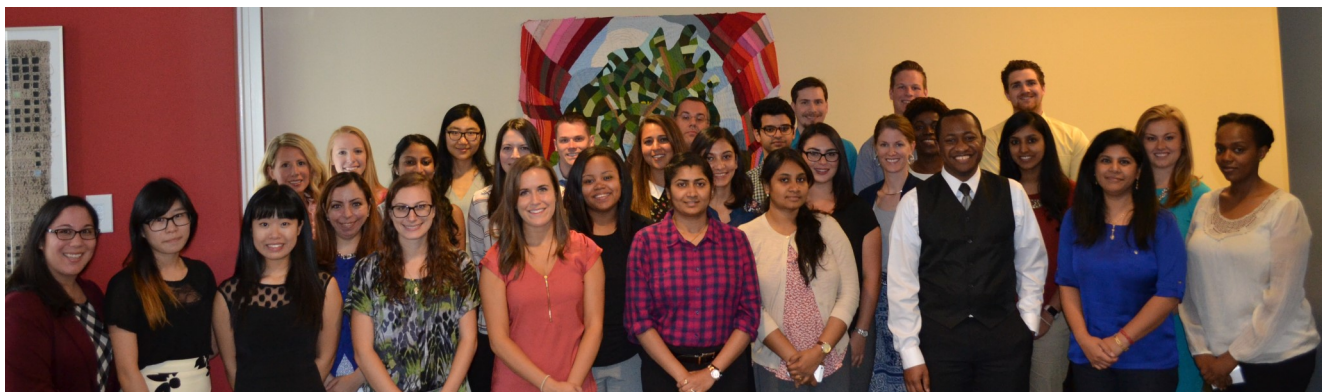
The 2016 Patient Safety Fellows.

treatment. The Fellows will conduct on-site observations at Fine Award-winning healthcare facilities and receive mentorship from the winners, equipping Fellows with the skills and knowledge to improve their own workplaces emerge as champions for quality and safety.