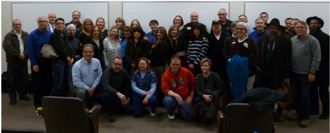
A sampling of the Jewish community members and local law enforcement officers who participated in Stop the Bleed training on March 14.