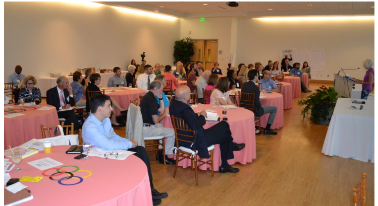
JHF's event on May 3 builds off the success of the Foundation's first charrette on exercise and recreation (pictured here), which was held in August of 2016.