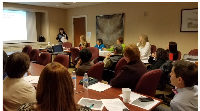
The JAA's quality committee meeting in mid-March.

Recent Jewish Association on Aging (JAA) board and quality committee meetings displayed the ever-growing, more than 20-year-long partnership forged between JHF and the JAA to provide a high-quality continuum of care for seniors. The meetings focused on how JHF and JAA are using Perfecting Patient Care SM (PPC)—the Foundation's curriculum to increase efficiency, eliminate errors, and achieve better outcomes—as a system-wide method for continuous improvement at the JAA.